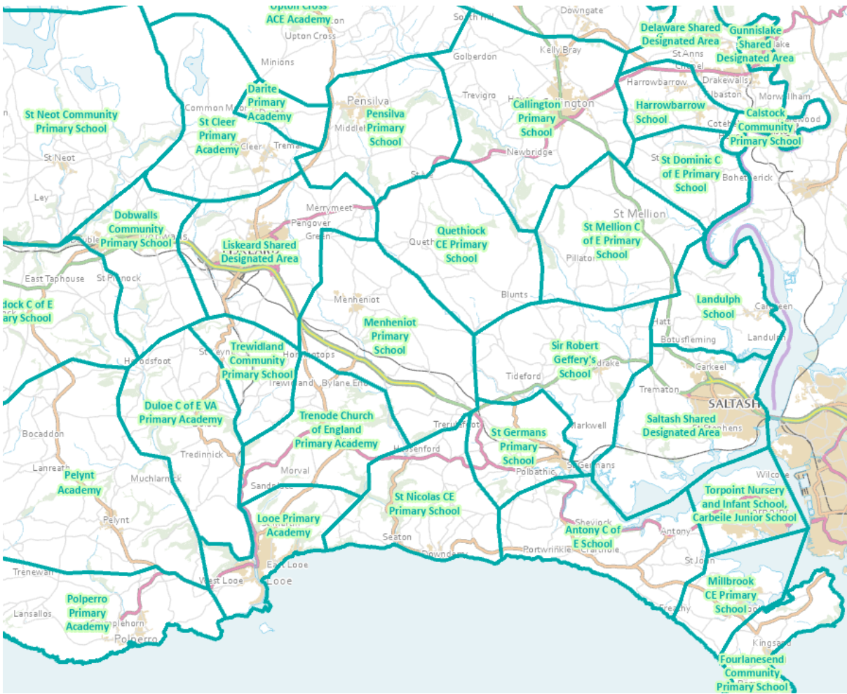
Appendix 2 – Primary Schools Designated Area